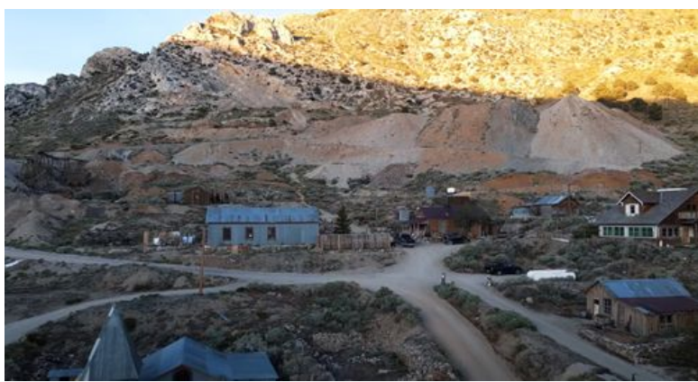
Mr. Underwood has documented his first six months living full-time in the abandoned mining town of Cerro Gordo on YouTube.

In 2018, a friend texted Mr. Underwood asking if he wanted to buy a ghost town. After scoping out site maps and images of the old abandoned town, he hustled up some investors and they purchased it. The plan is to restore the town, so people can come and stay and enjoy the peace and solitude. There are 22 buildings, including a church, hotel and general store.